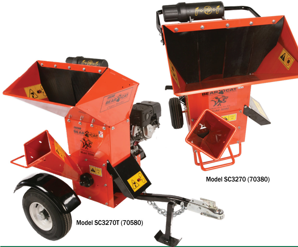
Model SC3270 (70380)

The new "Four-Wheel Tow Hitch", 75591-00, allows for easy hookup and towing capabilities.