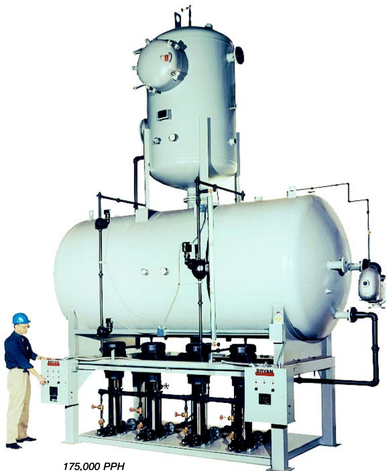
175,000 PPH unit shown

The Bryan tray type deaerator is unsurpassed in performance and reliability. These units are ASME Code pressurized units, and are guaranteed to deliver deaerated water at a maximum oxygen content of .005cc/l (7PPB) and zero measurable CO 2 . All internal surfaces that come in contact with undeaerated water are constructed of type 304L stainless steel for long life and low maintenance. Their long residence time makes them readily adaptable to all systems, even where wide load swings occur.