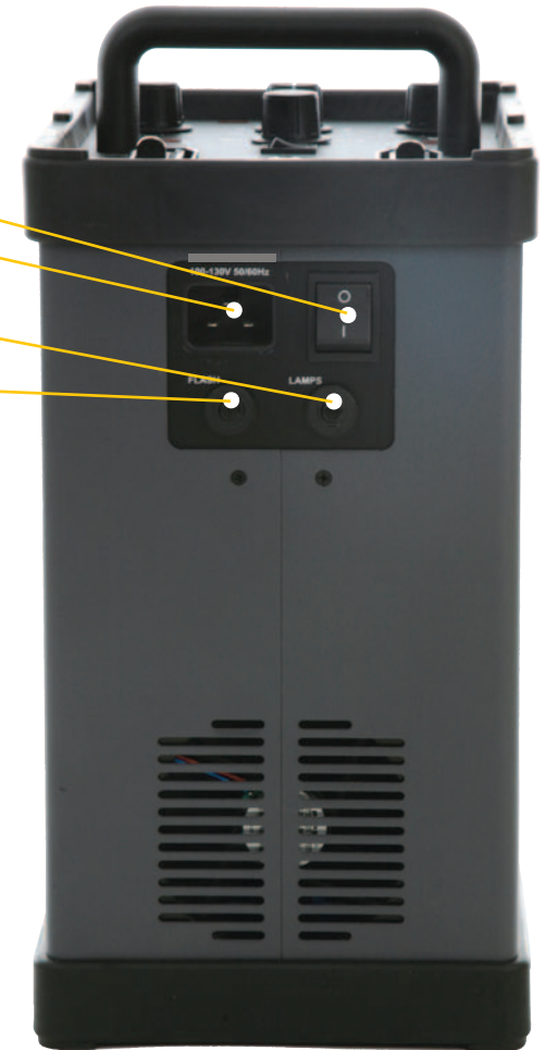
The AC Inlet, On/Off Switch and Thermal Reset Buttons are mounted on the rear panel.

3 The Fast/Slow Switch, Overall Power Selector and Modelling Mode Selector are common to both channels.