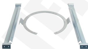
C-Ring / V-Rails

NOTE: IT IS MANDATORY THAT THIS SECONDARY SUPPORT BE UTILIZED IN DROP CEILINGS FOR SAFETY AND SEISMIC CONSIDERATIONS.