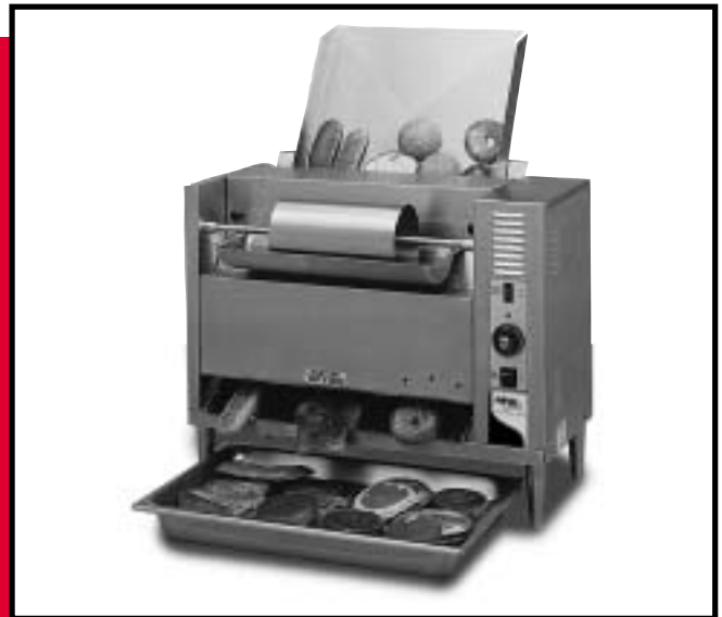
MODEL M-83 BUN GRILL TOASTER