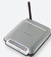
Wireless G USB Print Server