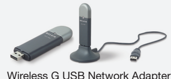
Wireless G USB Network Adapter

Look for these other Belkin wireless networking products: