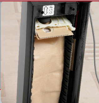
The dust bag is 'universally' sized and is easy to interchange