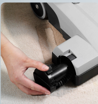
The brush is easily accessed without the need for tools for easy replacement, maintenance and cleaning