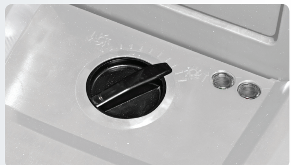
Indicators guide the user