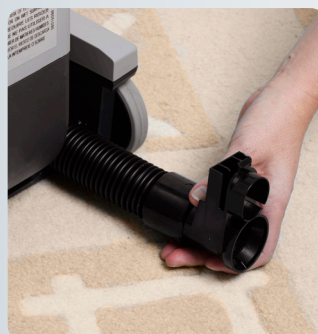
Easy access to suction hose for removal of any blockages that may arise