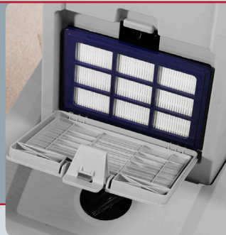
A HEPA 13 filter is optional for all models in this series so that the machine can be used where maximum dust filtration is required