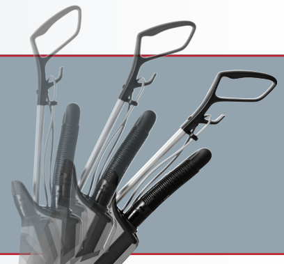
The handle is adjustable so that it is comfortable to use regardless of the user's height. Lowering of the body allows cleaning beneath furniture