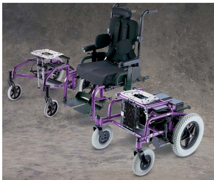
Detachable seat frame offers a host of benefits for caregivers and health care providers.