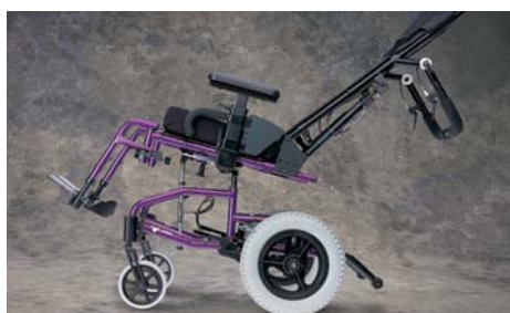
Reclining back option is interchangeable with the fold-down back.