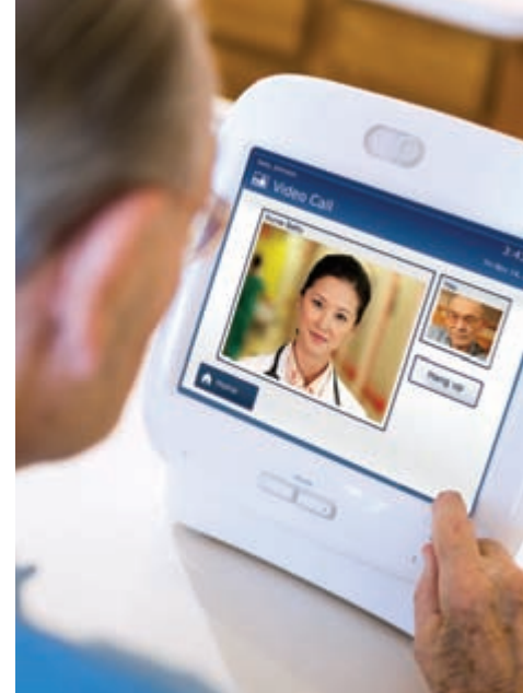
Healthcare professionals can arrange and conduct two-way video calls with patients.

Educational materials, reminders, questions, and units of measure used during a session are presented according to local usage and conventions, as appropriate.